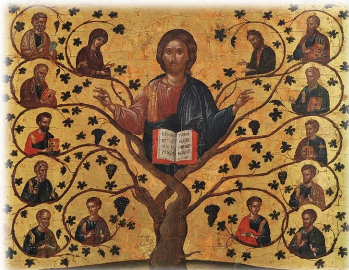
Christ, the True Vine, by Anonymous c. 16 th cent.

Introit Ps. 46: 2: Clap your hands, all ye nations: shout unto God with the voice of joy. Ps. 46: 3. For the Lord is most high, He is terrible; He is a great King over all the earth. Glory be to the Father.