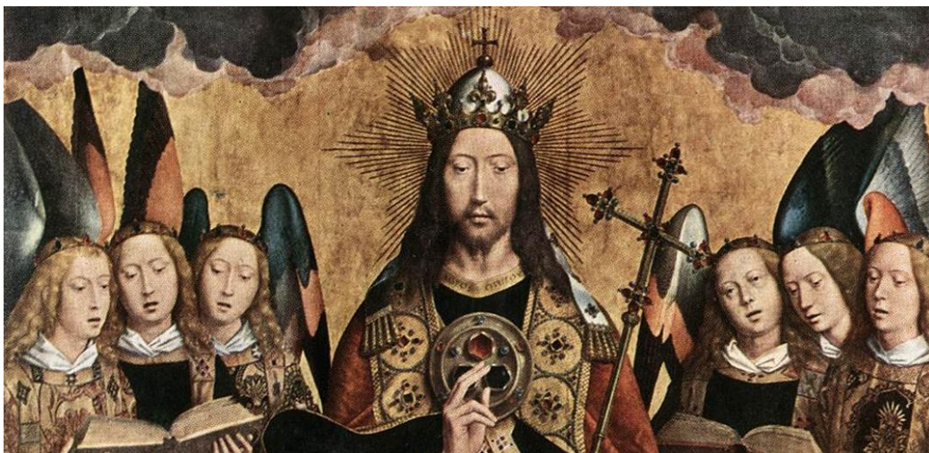
Christ Surrounded by Musician Angels , by Hans Memling c. 1480 A.D. “For the Lord is most high, He is terrible; He is a great King over all the earth.”