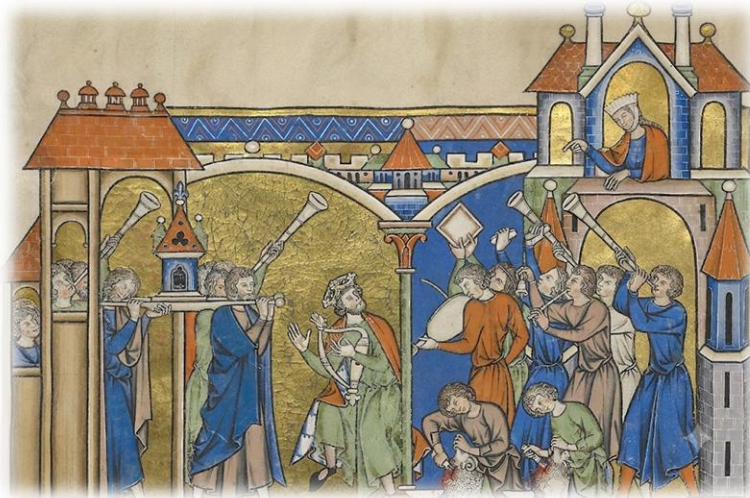
• David's Greatest Triumph, The Ark Enshrined in Jerusalem , from The Morgan Picture Bible by Anonymous c. 1244–1254 AD “I will go round, and offer up in His tabernacle a sacrifice of jubilation: I will sing, and recite a psalm to the Lord.”