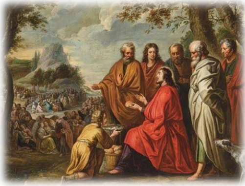
The Multiplication of the Loaves and Fishes , Flemish School, 17 th cent.

Introit Ps. 27: 8, 9: The Lord is the strength of His people, and the protector of the salvation of His anointed: save, O Lord, Thy people, and bless Thine inheritance, and rule them for ever. Ps. 27: 1. Unto Thee will I cry, O Lord: O my God, be not Thou silent to me, lest if Thou be silent to me, I become like them that go down into the pit. Glory be to the Father.