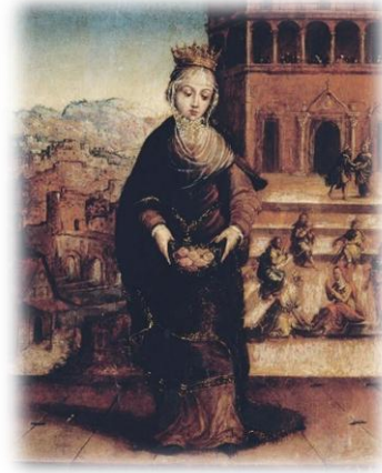
Rainha Santa Isabel, o Milagre das Rosas, Anonymous c. 16 th cent.

To request the celebration of a Holy Mass for a personal intention, use Mass request envelope (vestibule) or come to the Rectory (Monday to Thursday 9:00 am to 2:00 pm)