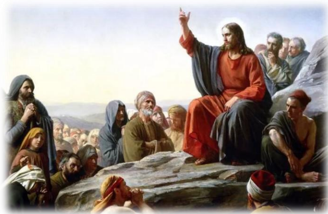
The Sermon on the Mount by Carl Bloch