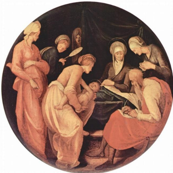
Nativity of Saint John the Baptist, by Jacopo Pontormo c. 1526

Join us Wednesday, June 24th, 7:00 PM for St. Josaphat’s annual “Falò di San Giovanni” (Saint John bonfire), sponsored by Agnus Dei Knights of Columbus Council #12361 on the feast of his nativity! The bonfire honoring the Baptist’s birth symbolizes the light that John the Baptist brought to the world, pointing towards Jesus Christ. Celebrate our great Catholic tradition with prayer, friends, and family. This is an excellent opportunity to reverently dispose of any religious books/items as well. Festive pot luck refreshments will be served in the Parish Hall. Evviva San Giovanni Battista!