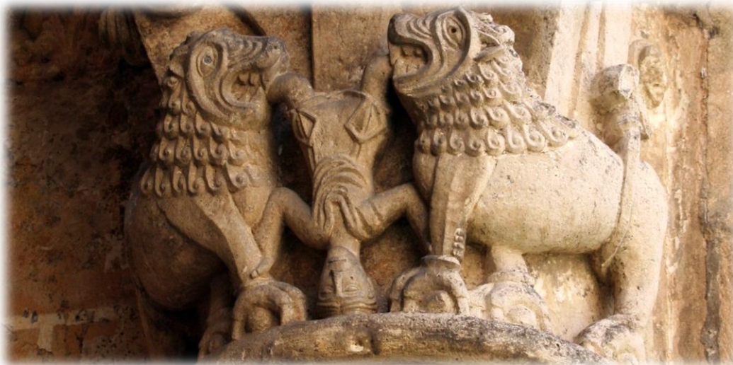
Column Capitol, Abbaye de la Sauve Majeure, near Bordeaux, France.

Questions? camps@institute-christ-king.org