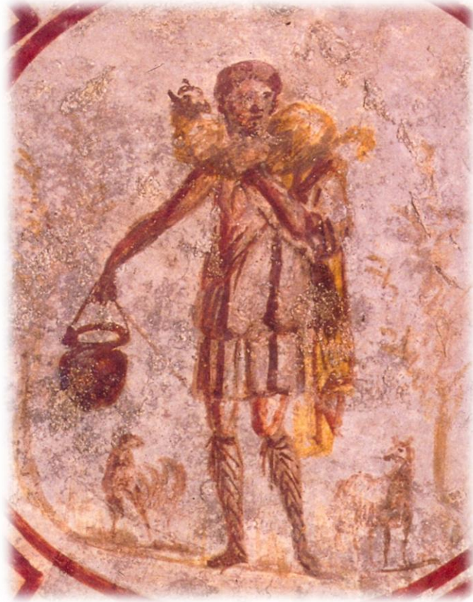
The Good Shepherd, 3 rd century Catacombs of St. Callixtus, Appian Way, Rome

Introit: Ps. 24:16, 18. Look Thou upon me, and have mercy on me, O Lord; for I am alone and poor. See my abjection and my labour, and forgive me all my sins, O my God. Ps. 24:1-2. To Thee, O Lord, have I lifted up my soul: in Thee, O my God, I put my trust; let me not be ashamed. Glory be.